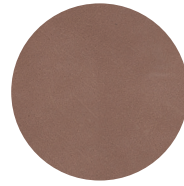
Aurula Old Pink