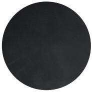
Sadie Dark Grey