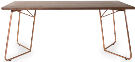
CHARLES COPPER, WALNUT