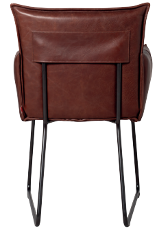
With arm, brushed stainless steel