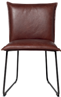
Without arm, old glory